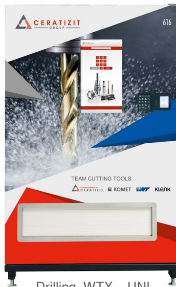
Drilling, WTX – UNI

Choose your favourite from our top five designs for the TOOL-O-MAT 840: