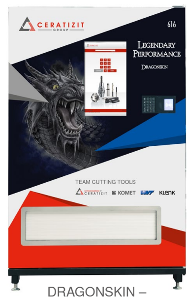
DRAGONSKIN – Coating technology