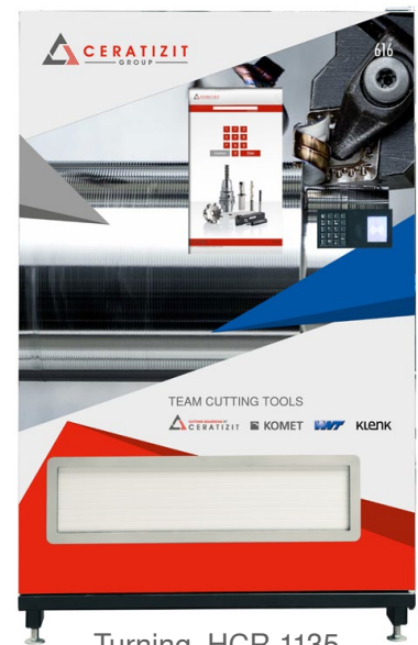
Turning, HCR 1135