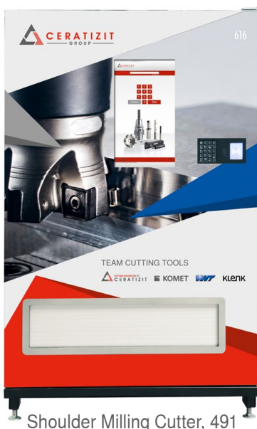
Shoulder Milling Cutter, 491