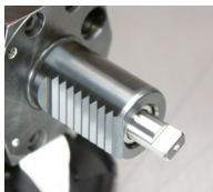
Castleated shaft e.g. Duplomatic, DIN 1809