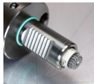
Spline shaft e.g. Sauter, DIN 5480/5482